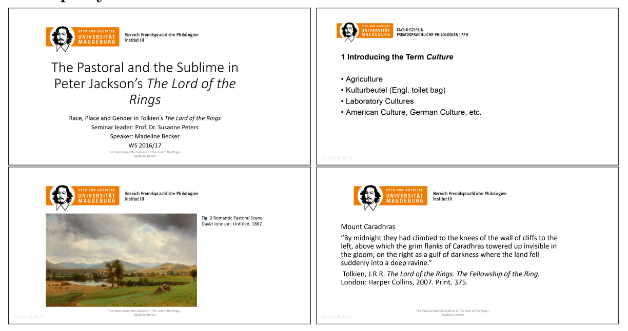
Illustration Captions and Sources

Like any other source, illustrations or screenshots on presentation slides need to be styled according to MLA Referencing Style. All illustrations on slides should be complemented by a caption underneath or next to them. Enumerate all illustrations and precede the number with the label "Fig." ("Figure"). If you discuss the work from which the illustration or screenshot is taken, the caption should act like an in-text reference and provide the information needed to identify an entry on the works cited list as well as the page number or time stamp where the illustration or screenshot appears in the work: