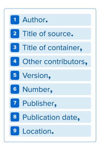
Fig. 3: Core Elements